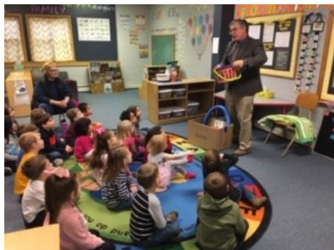
Chapel in the ELC due to the rainy/snowy weather.

At the end of February, the teachers, students and families in the Early Learning Center will be celebrating National Lutheran Schools Week. This week provides nearly 2,000 preschools, elementary schools and high schools the opportunity to proclaim and celebrate God's work among us in schools of The Lutheran Church-Missouri Synod. It brings us great joy to hear the babes in our center share prayers, songs and stories they have learned with their loved ones. We are thankful for the opportunity to share Jesus' amazing love with children and their families. Praise God! We will kick off the week by singing at the early service on February 23 rd . Throughout the week we will have dress up days, fulfill a service project and invite their parents in for Muffins with Moms and Donuts with Dads. It is bound to be a wonderful week!