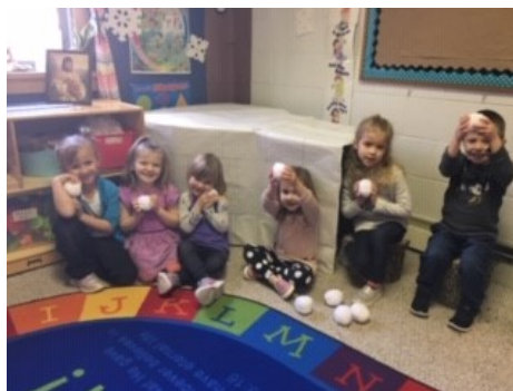
Indoor snowball fights can be fun too!