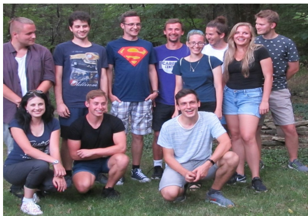
Czech/ Slovak exchange students at September picnic with host families.