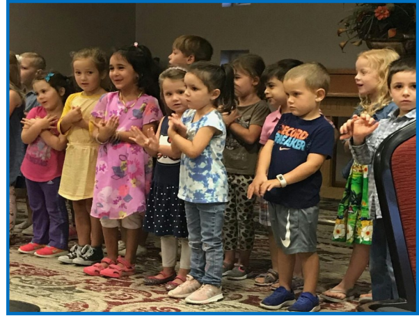
(Singing at Meadowlark Hills)